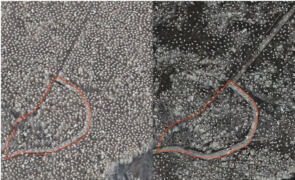
Figure 5. Images showing the dramatic differences in the density of AOS between 23 June 2014 (left) and 27 June 2023 (right). In 2014 there were 246 AOS in the delimited area whereas in 2023, there were only 169 – a decrease of 30%.

Comparison of the numbers of AOS in 2023 with those in the same areas during the last survey in 2014, indicates an overall decline of 41% and a marked reduction in the density of AOS throughout the colony (Figure 5), in accordance with observations by Sheddon & Lane (2023). The slight increase in numbers in Area 11 is an artifact since numbers there were increasing rapidly in 2014. A count of an aerial image taken on 14 June 2019 gave 2,360 AOS providing evidence of a decline of c.28% between 2019 and 2023 in line with decreases in the other areas.