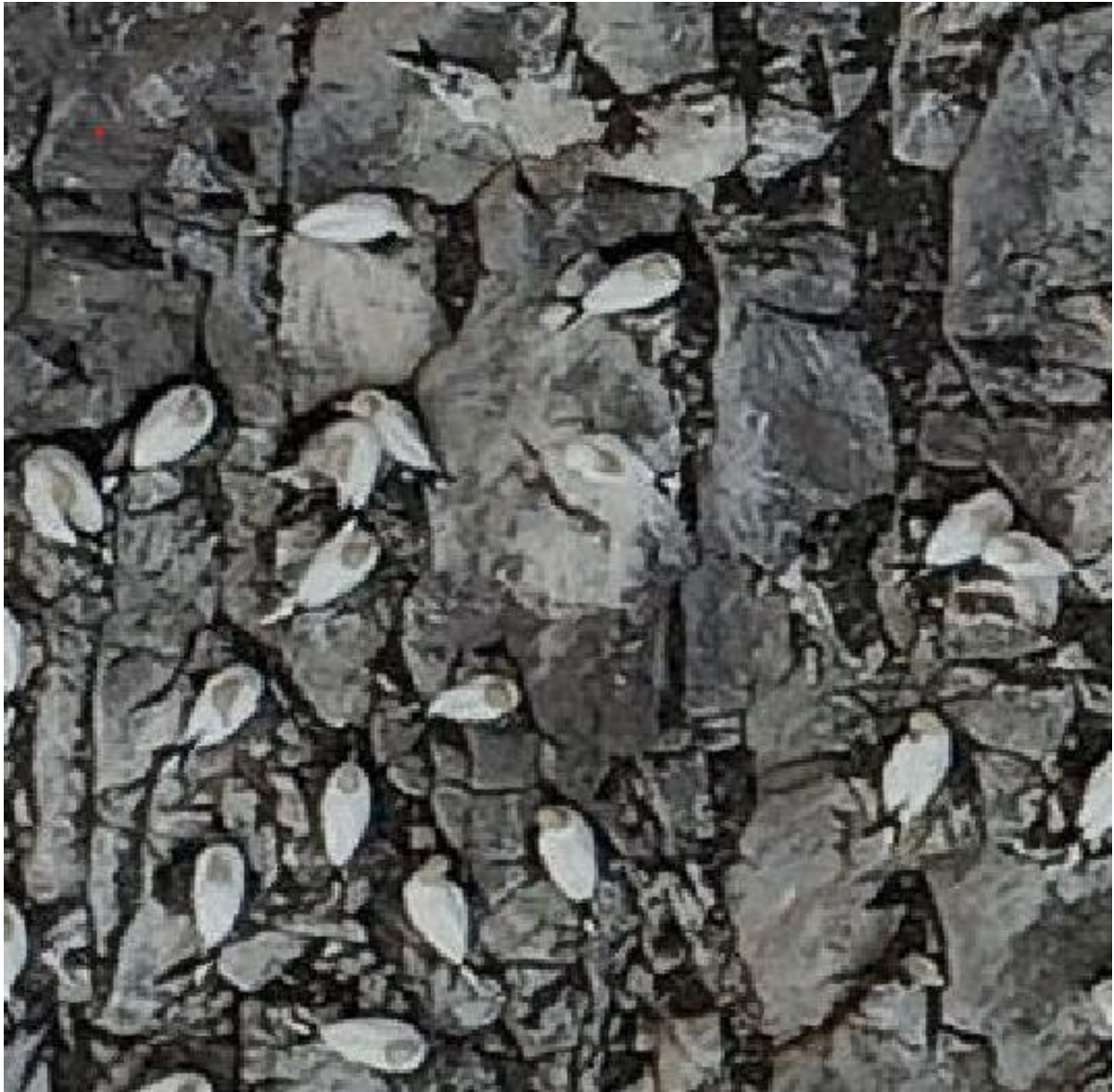
Figure 3. Part of the orthomosaic vertical image showing two pairs and 15 single Gannets. The topmost bird is an immature with clearly visible black wing coverts.