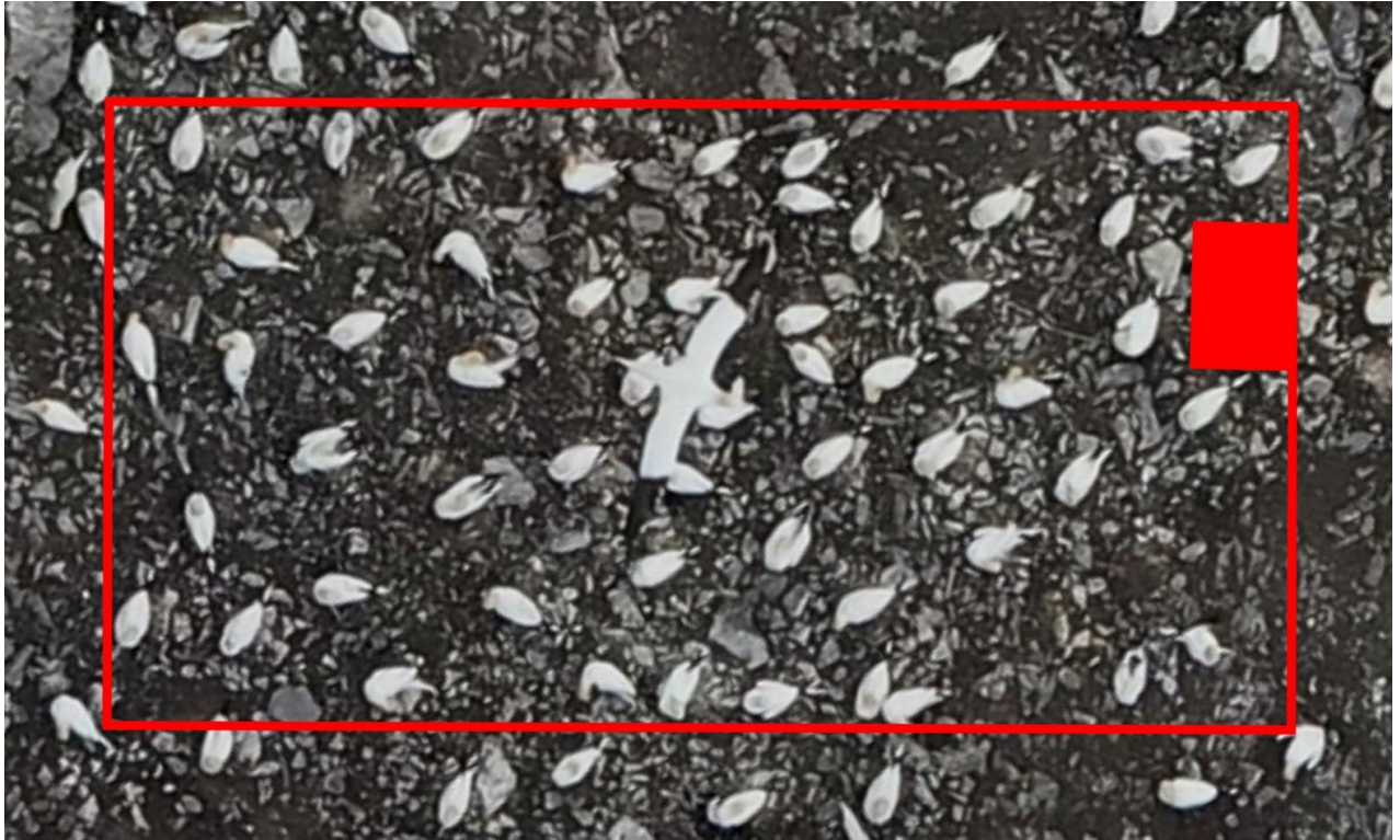
Figure 4. Close up from the drone image of the area followed during the breeding season using the Scottish Seabird Centre webcam in June 2023. There are three pairs and 47 single birds. Although most birds appear to be incubating, no traces of nests are visible.

count. Very few apparently dead birds were recorded (mean 23, range 9 – 34), most birds with outstretched necks and spread wings were judged to be displaying.