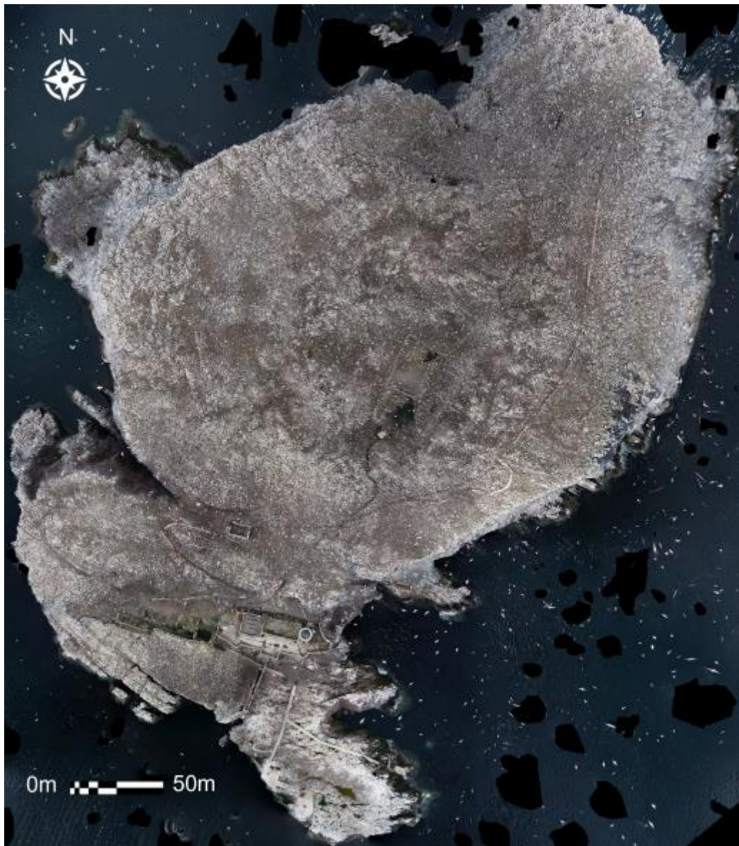
Figure 1. The orthomosaic vertical image from a drone survey on 27 June 2023 used to make the count of Northern Gannets on the Bass Rock in 2023.

the population on the Bass Rock, Firth of Forth. Here numbers increased from c.3000 pairs in 1904 to over 75,000 Apparently Occupied Sites (AOS) in 2014 when the Bass Rock overtook St Kilda (Scottish Western Isles) and Bonaventure Island (Canada) to become the world's largest Northern Gannet colony (Nelson 2002, Murray et al. 2014). However, the Gannet's fortunes changed abruptly and